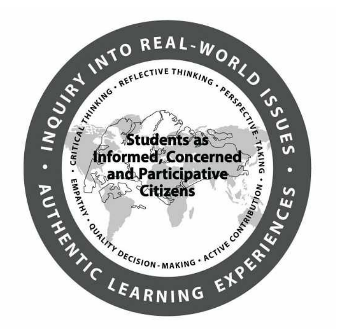
Figure 1.1 The Singapore Social Studies Curriculum